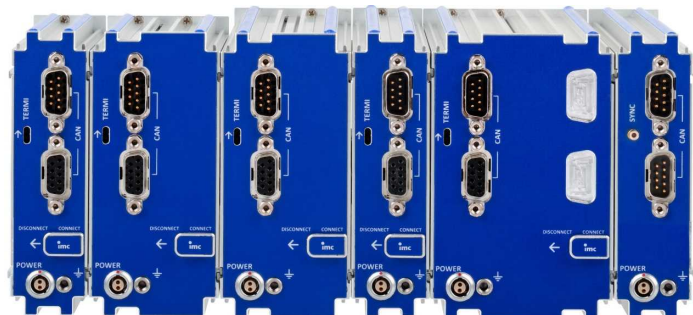
rear view of this block: CAN, Power supply, Terminator, Locking slider