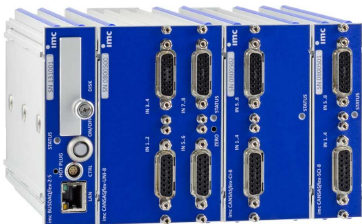
imc CANSASflex modules connected (Click-mechanism) in a block with imc BUSDAQflex Logger (left)